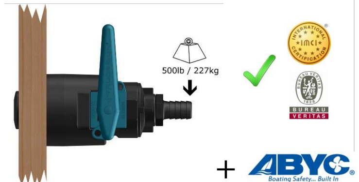
ABYC H-27 Standard requirements;

Skin Fittings (Thru Hulls), when assembled together with TruDesign Ball Valves and Load Bearing Collars, will comply with ABYC H-27 standards. This allows the entire assembly to withstand a 500lb (226.8kg) load applied to the inboard end of the assembly for a minimum of 30 seconds without any damage occurring.