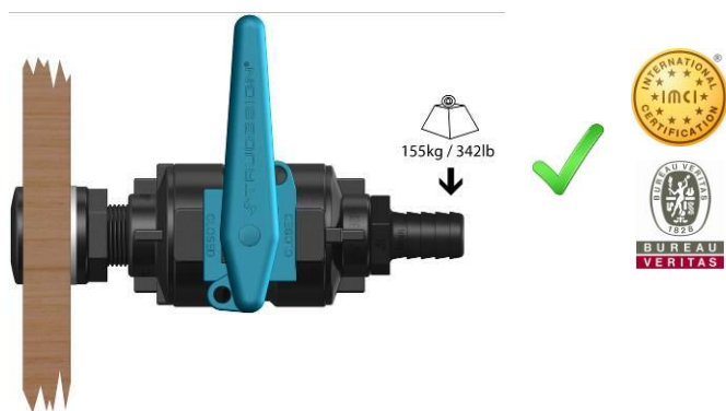
ISO 9093-2 Standard requirements;

In accordance with ISO 9093-2 standards, Skin Fittings (Thru Hulls) are subjected to a 155kg (341.7lb) load, applied to the threaded section for a minimum of 30 seconds, without any damage occurring. TruDesign Skin Fittings (Thru Hulls) meet this standard.